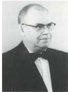
H.E. Early 1954